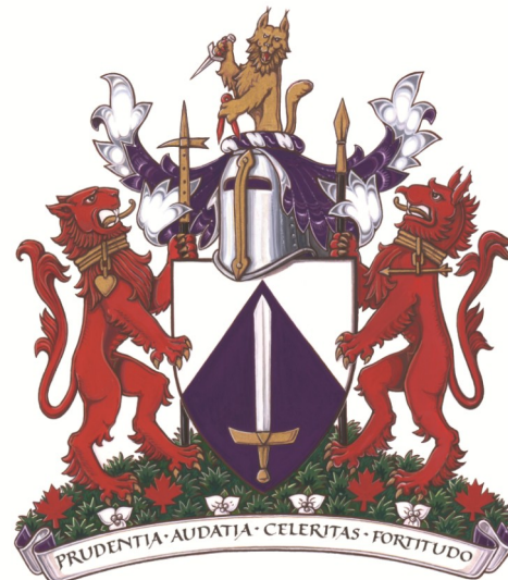
Grant of Arms to The Academy of European Medieval Martial Arms (2008)

From a young age I was encouraged by my father to draw from nature. Some of the most attractive books I found at home were about gothic art. I drew pictures inspired by medieval illuminations, before I knew what they were. Later I studied Art Education and Art History in Poland and got my first job as curator at a public art gallery.