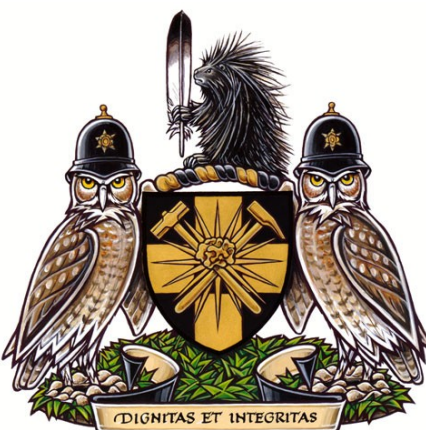
Timmins Police Service Arms