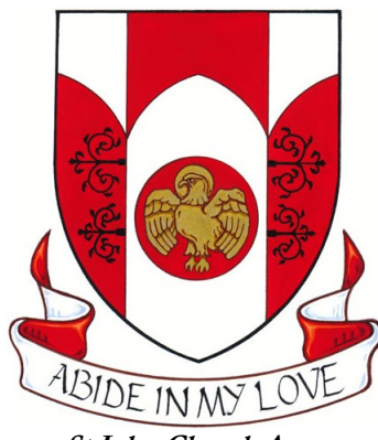
St John Church Arms

St. John Anglican Church ( Ancaster ), Grant of Arms, Flag and Badge ~ July 15, 2015